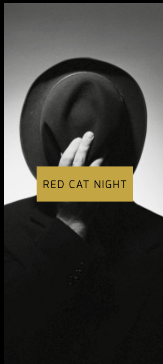
RED CAT NIGHT