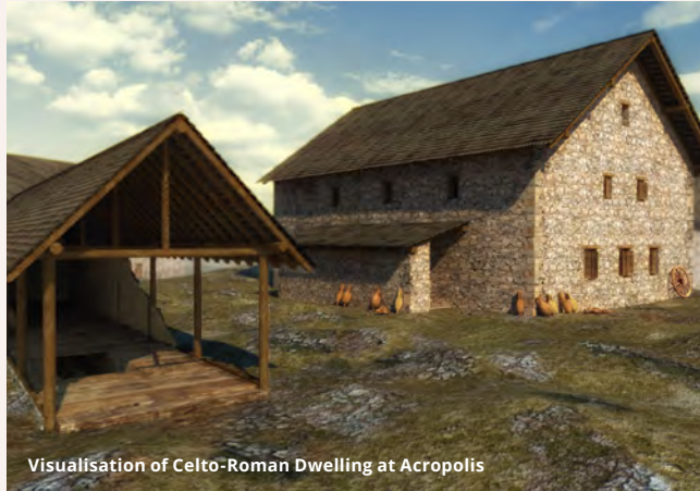
Visualisation of Celto-Roman Dwelling at Acropolis

Foundation of a Celtic oppidum (i.e. fortified settlement) on the territory of current Bratislava at the end of the 2nd century BC took place due to favourable location at crossroads of long-distance roads. The Celtic town in Bratislava covered approx. 240 acres. A fortified acropolis dominated at the top of the castle hill. The settlement beyond murals extended to the current Old Town, with a pre-castle settlement at what is today Námestie Slobody Square. The Celtic settlement reached far beyond the town centre – the Devín oppidum was a strategic trade centre.