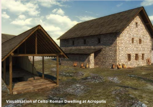
Visualisation of Celto-Roman Dwelling at Acropolis

Foundation of a Celtic oppidum (i.e. fortified settlement) on the territory of current Bratislava at the end of the 2nd century BC took place due to favourable location at crossroads of long-distance roads. The Celtic town in Bratislava covered approx. 240 acres. A fortified acropolis dominated at the top of the castle hill. The settlement beyond murals extended to the current Old Town, with a pre-castle settlement at what is today Námestie Slobody Square. The Celtic settlement reached far beyond the town centre – the Devín oppidum was a strategic trade centre.